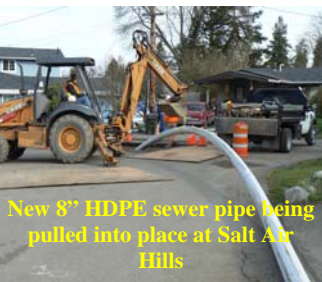
New 8" HDPE sewer pipe being pulled into place at Salt Air Hills

Durnford and Sons and their subcontractors are using some interesting construction techniques including pipe bursting. Pipe bursting is a "trenchless technology" which pulls a new pipe through an existing pipe as it simultaneously destroys the existing pipe. The subcontractor is set to burst about 7,900 lineal feet of sewer main. They will install another 2,300 lineal feet of sewer main using a more traditional "cut and cover" method. Their work also includes replacing 4685 lineal feet of lateral sewers and 59 manholes. When the pipes have been placed the roads will receive a fresh layer of asphalt.