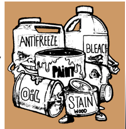
Examples of common household hazardous waste