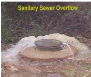
Sanitary Sewer Overflow

Rain water and ground water should not find its way into the sanitary sewer!